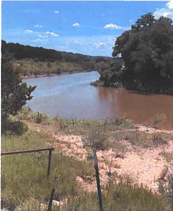
Bandera River Ranch

440 FM 3240 Bandera, Texas 78003 (830) 796-7260 Fax (830) 796-8262 www.bcragd.org